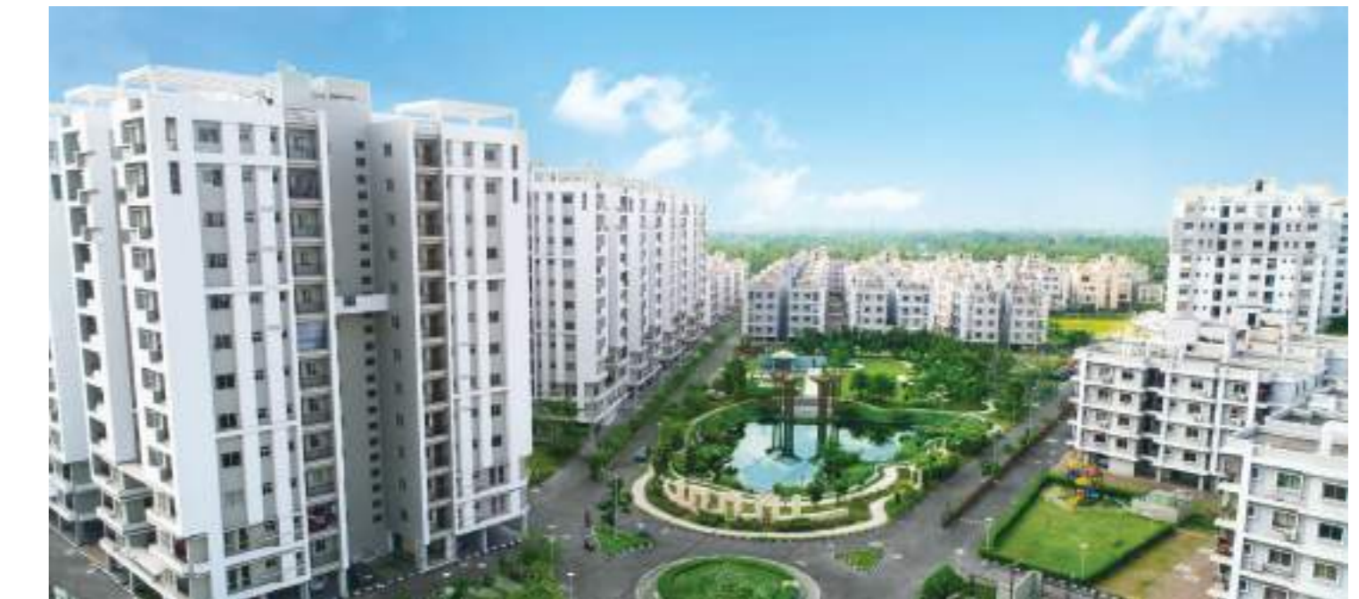
Greenfield City near Behala Chowrasta Metro