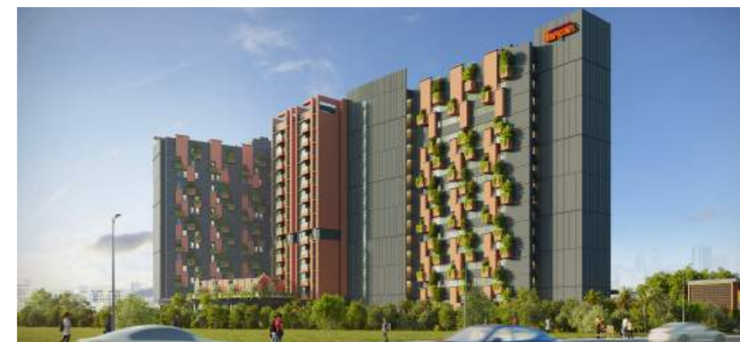
Primus Darpan Bengaluru