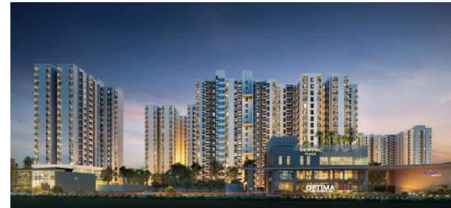
Optima Rajarhat Chowmatha

Established in 2013 in Bengaluru, Primus is committed to providing an active luxury lifestyle to seniors through passionate people, robust processes and intuitive technology. They are in the process of delivering 2000+ senior homes in Bengaluru, Chennai, Pune, Huderabad, Kolkata and Mumbai.