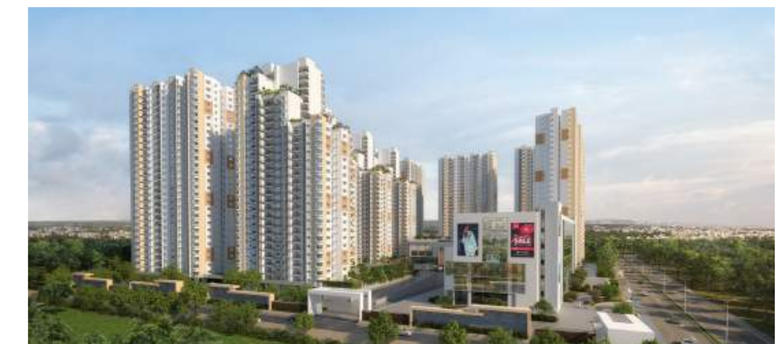
Primus Zion Chennai