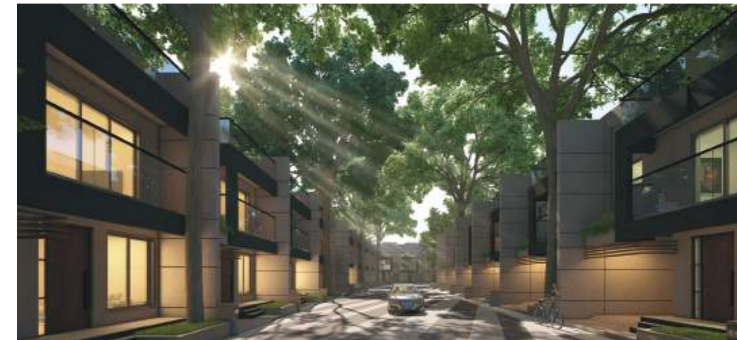
Botanica Southern Bypass