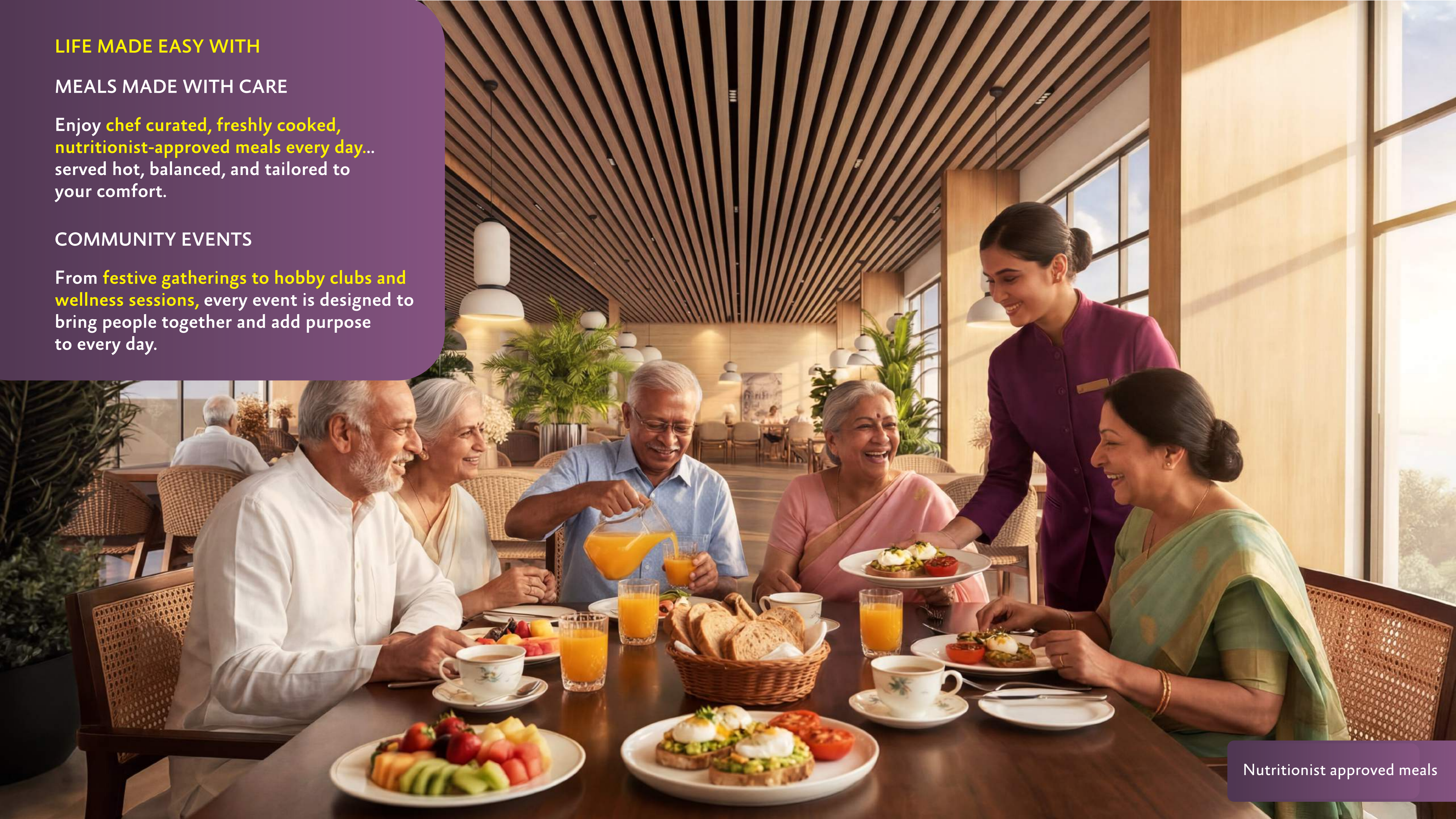
Nutritionist approved meals

From festive gatherings to hobby clubs and wellness sessions, every event is designed to bring people together and add purpose to every day.