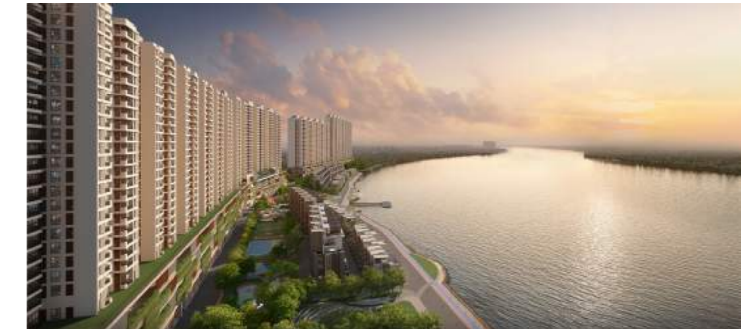
The Royal Ganges Batanagar