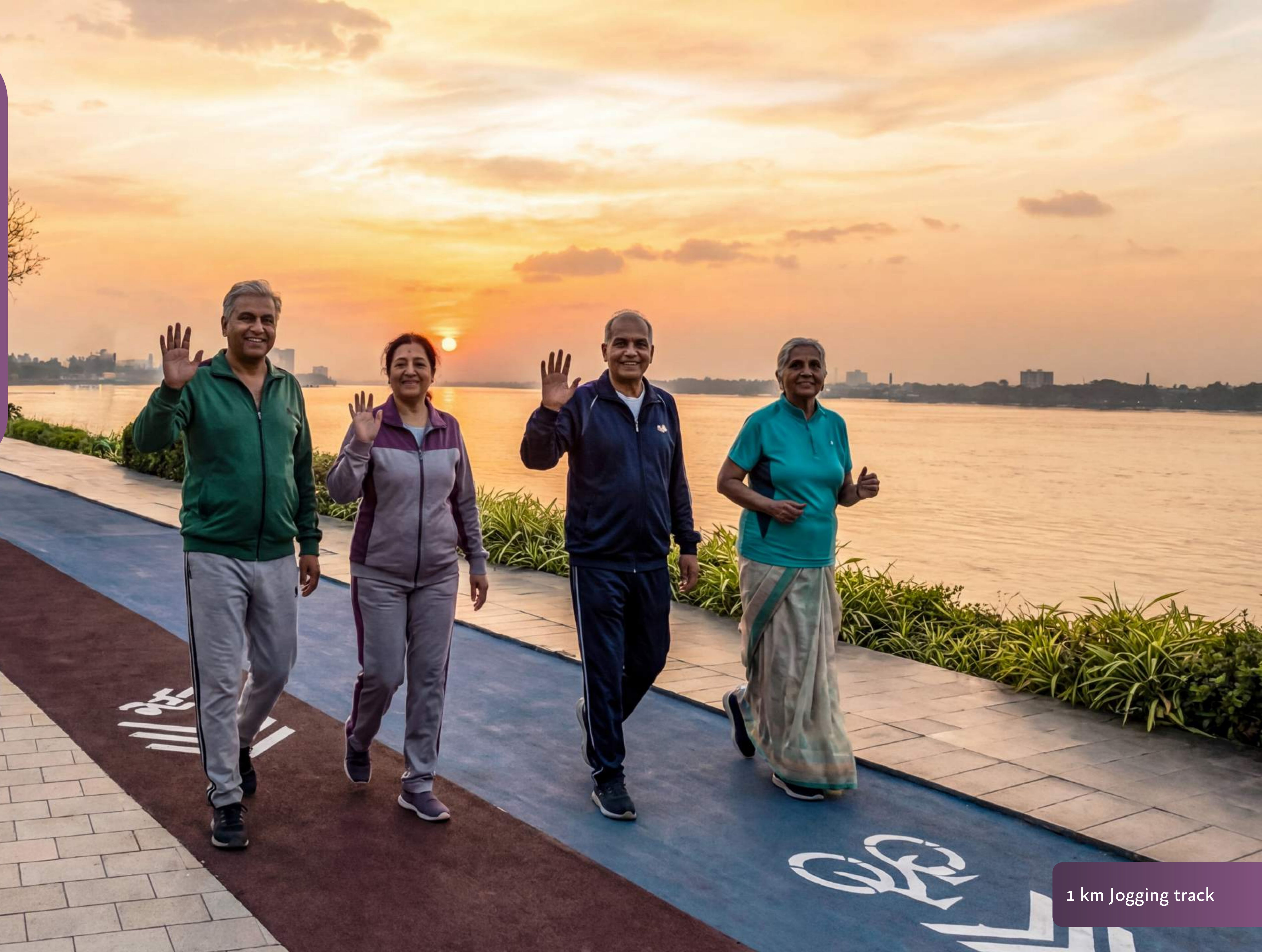
1 km Jogging track

The idea of the Blue Zone, inspired PRIMUS GANGES to plan a home for the ones above 55 to reverse their age and live longer with adequate support.