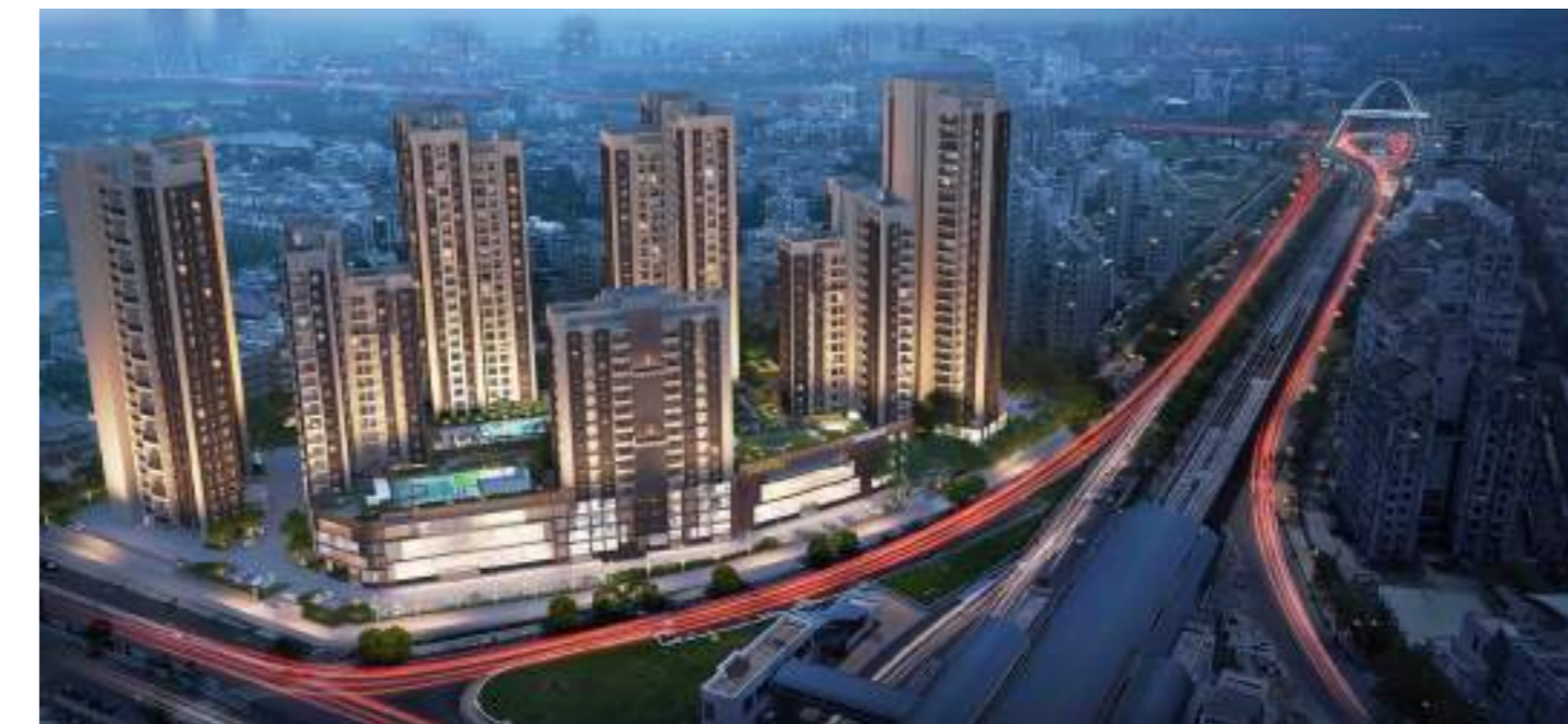
Town Square Newtown