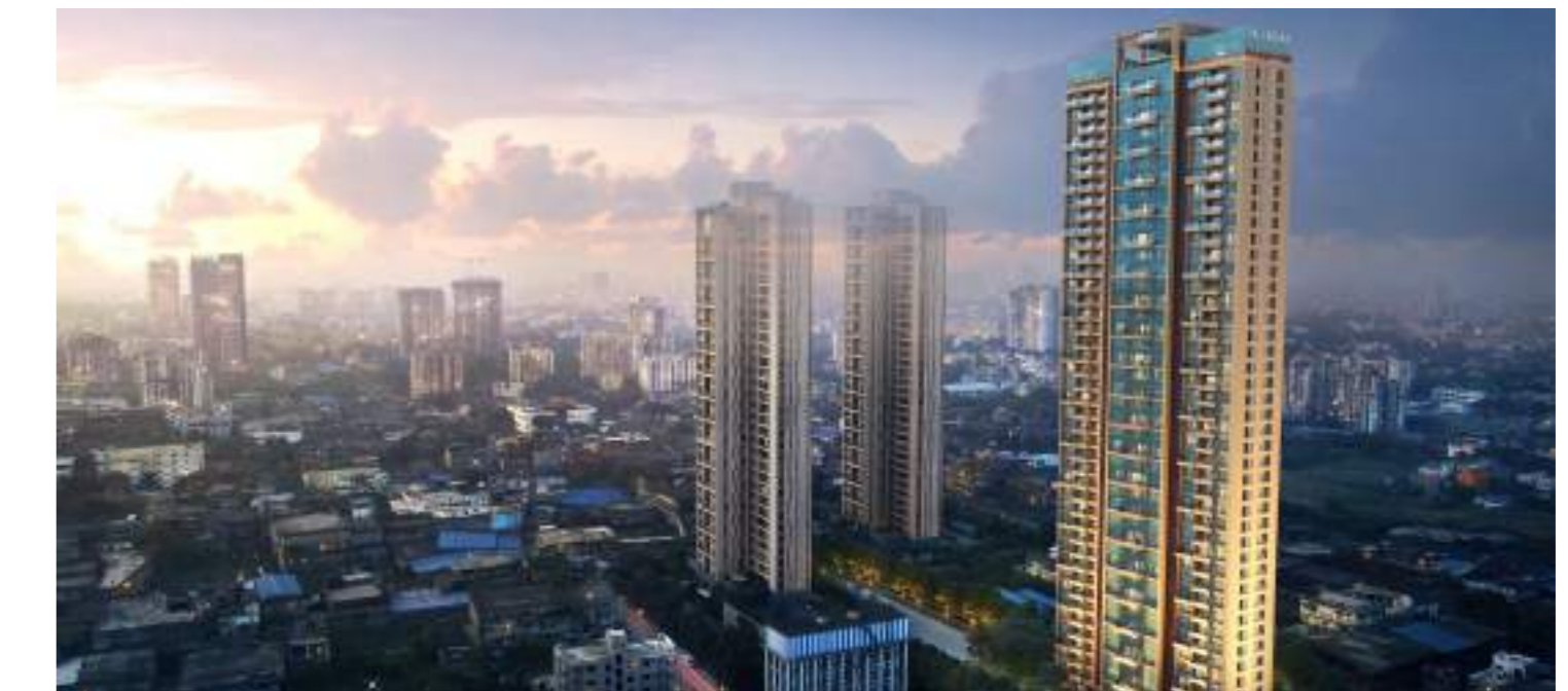
Palladina Off EM Bypass