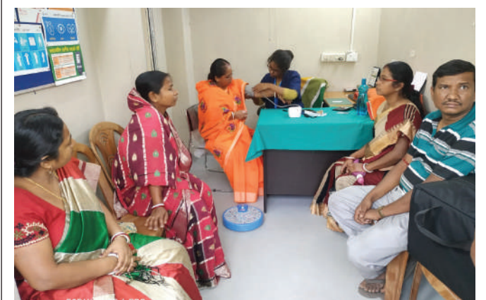
Patients being checked at the Primary Healthcare Centre

The focus of the clinic will be to provide patients with cost-effective and accessible primary health solutions by effectively using technology. The clinic aimed to provide sustainable healthcare for pregnant women and children through school health and maternal health programs. The clinic operations thus aimed to build trust and bonding with the local community.