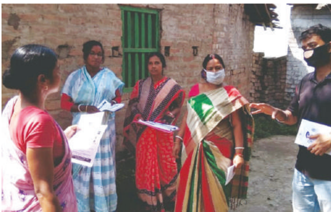
Self-help group visits the local village

The Interactive Voice Response was aimed to make the community aware of the various measures to be taken to fight COVID-19. Terminologies like social distancing, hand-washing hygiene and phobia around quarantines and self-isolation was explained in the local language. People were encouraged to answer the questionnaire for self assessment based on symptomatic behavior and seek doctor’s consultation, if required.