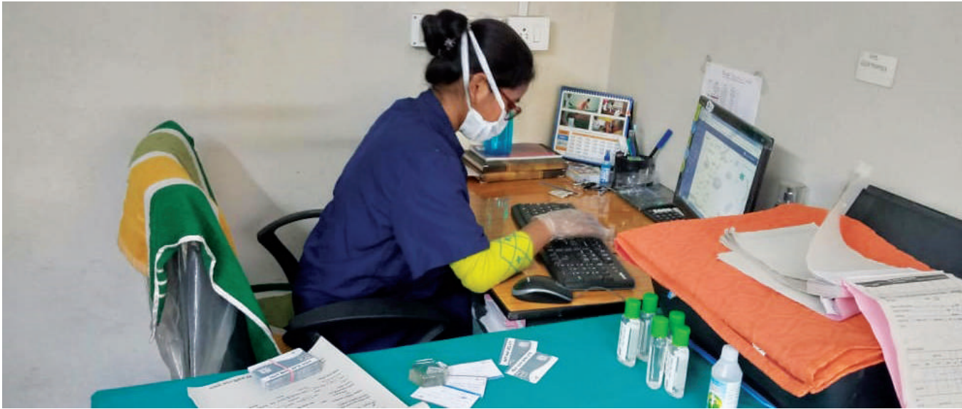
A healthcare personnel feeds patient data in the system for telemedicine