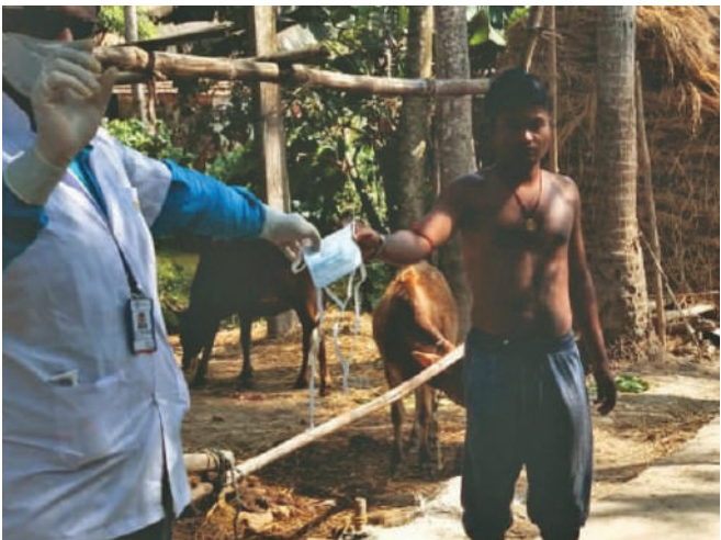
Masks being distributed to villagers