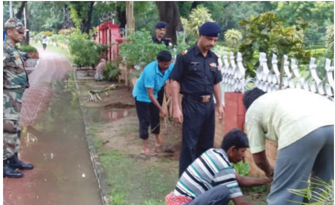
Tree plantation at the Fort Willaim

Kolkata, 26 August 2019 In an effort to make Kolkata a Cleaner and Greener place to live Srijan Realty joined hands with the Indian Army for an Urban Plantation Drive 2019 in Kolkata Maidan and Fort William. Adequate tree cover is an essential link in the bio-diversity chain, and to create sustainable and livable urban areas.