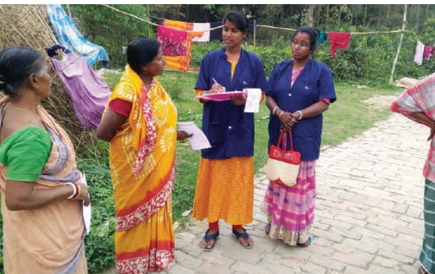
Field survey being conducted by the self-help group