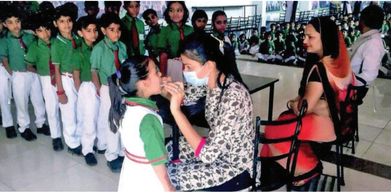
School children undergoing health check-up