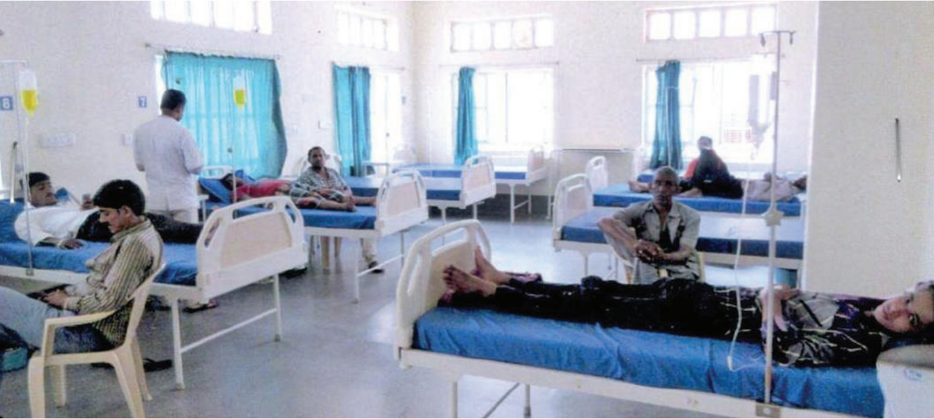
Patients at the IP Ward