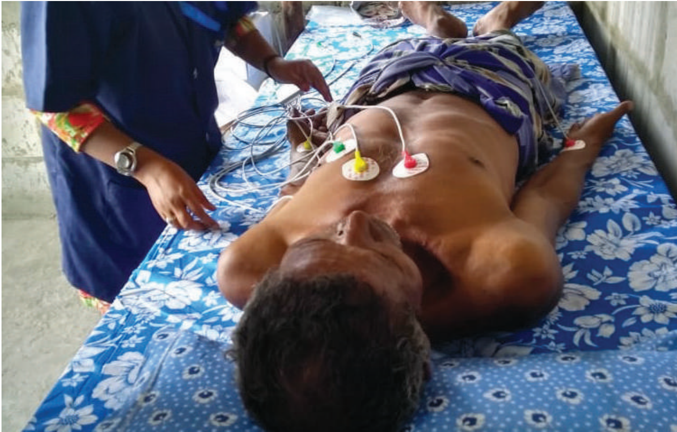
A construction worker undergoing ECG test at the Health Camp