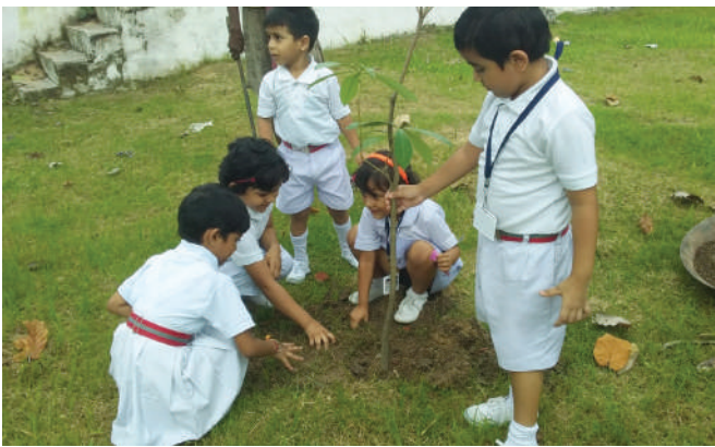
School children plant trees