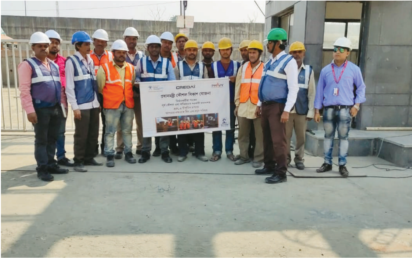
Workers display the Pradhan Mantri Kaushal Vikash Yojna banner