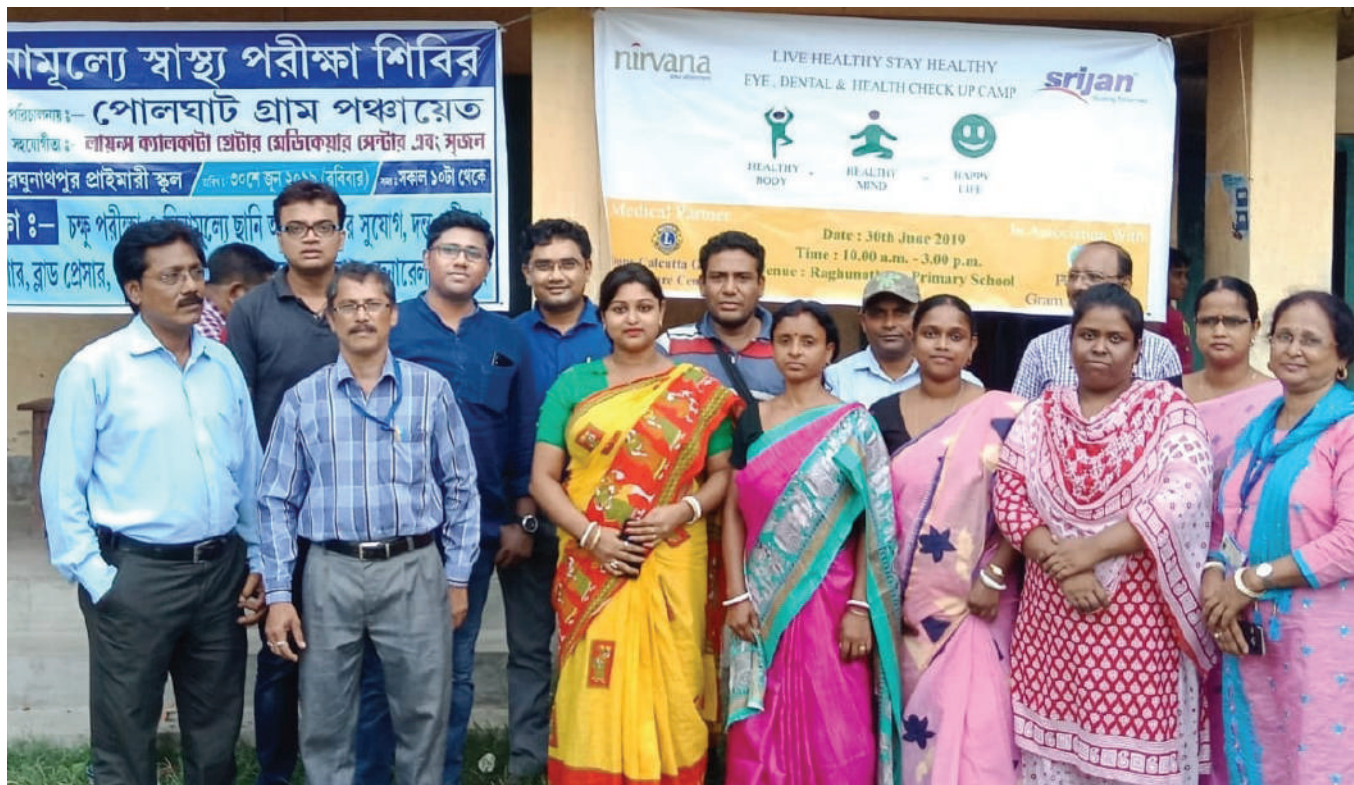
Poleghat Gram Panchayat members visit the health camp