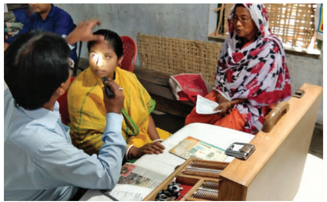
Eye check-up conducted at the camp

Raghunathpur-Sonarpur-Rajpur, 30 June 2019 Srijan Realty in association with Lions Calcutta Greater Medicare Centre and Poleghat Gram Panchayat conducted a general health check-up camp for the local community living in Raghunathpur village in Sonarpur Tehsil of South twenty-four Parganas district in West Bengal. There are around 615 houses in the village and Rajpur is nearest town which is approximately 4 kilometres away.