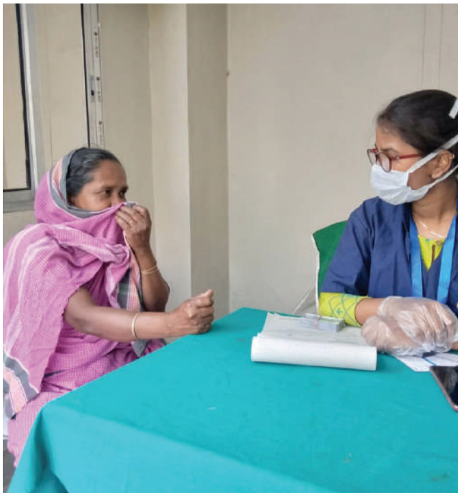
Villager sharing health details

He further informed that a Covid-19 Health Intervention Programme was also initiated for the factory workers and labourers working in and around Domjur area. The intervention focused on awareness, counseling and screening of Covid-19 by conducting General Health Camps with specific services like patient registration, measurement of patient vitals, patient screening and identifying high risk patients and referring them for further laboratory tests and providing medicines to patients as per diagnosis made by Doctor.