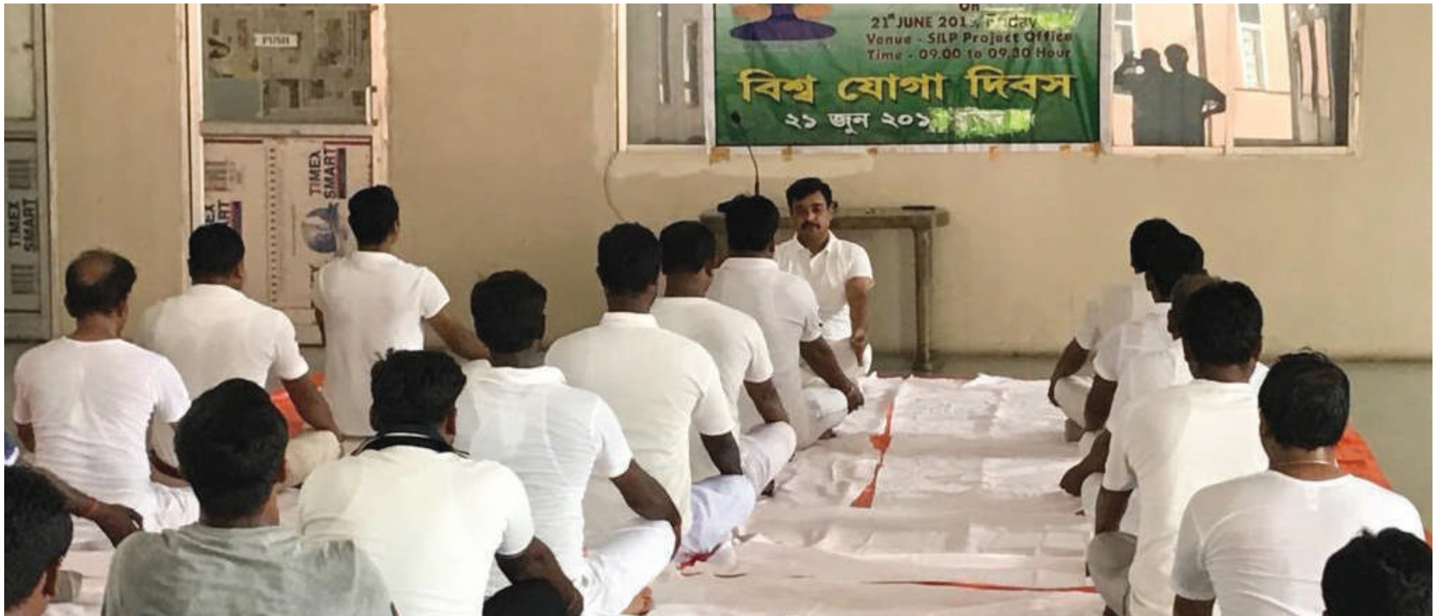
Employees performing Yoga