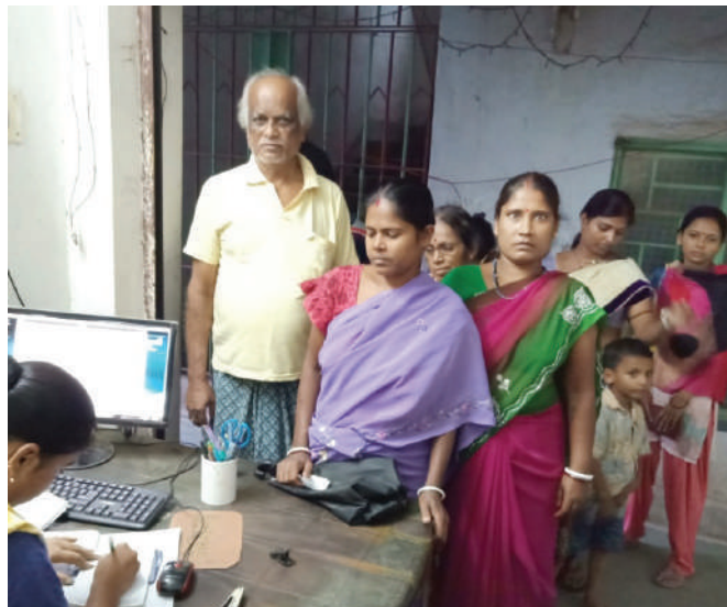
Patients standing in a queue to register themselves