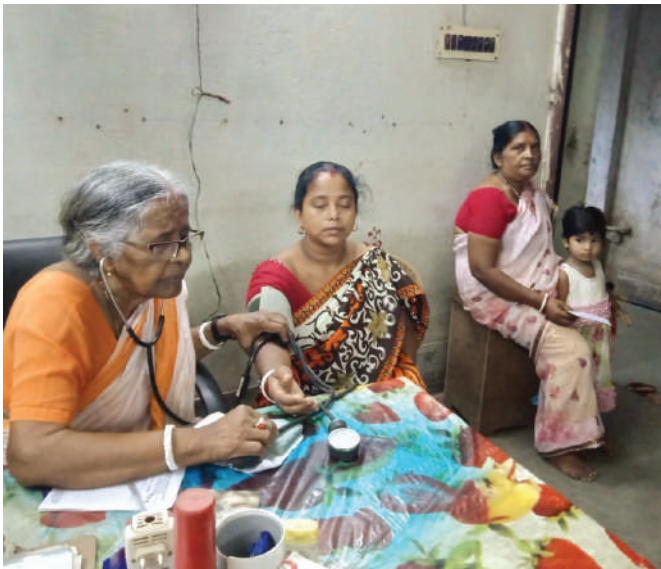
Doctor treating a patient at Shibrampur Clinic