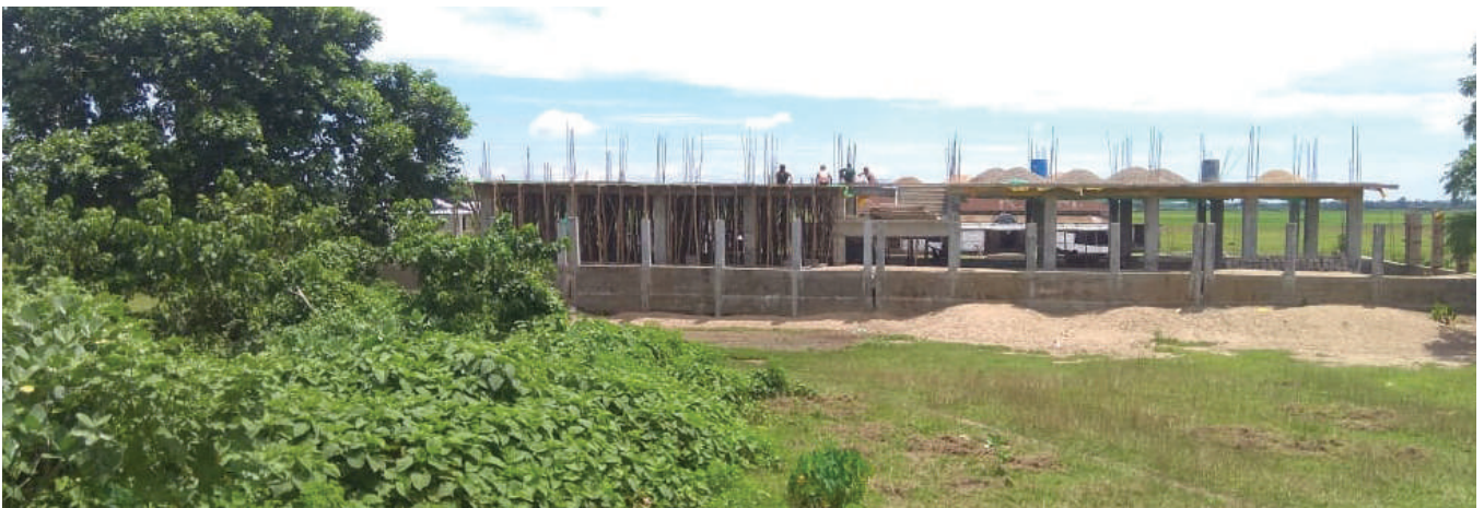
Under construction school building at Kalatek