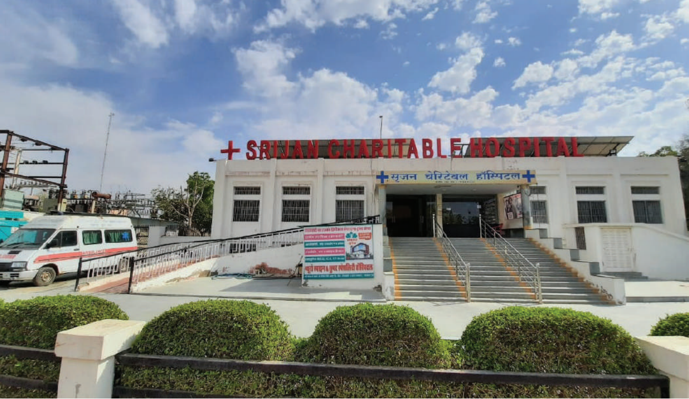
Srijan Charitable Hospital at Salasar