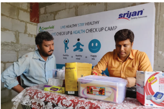
A worker receiving doctor's consultation.