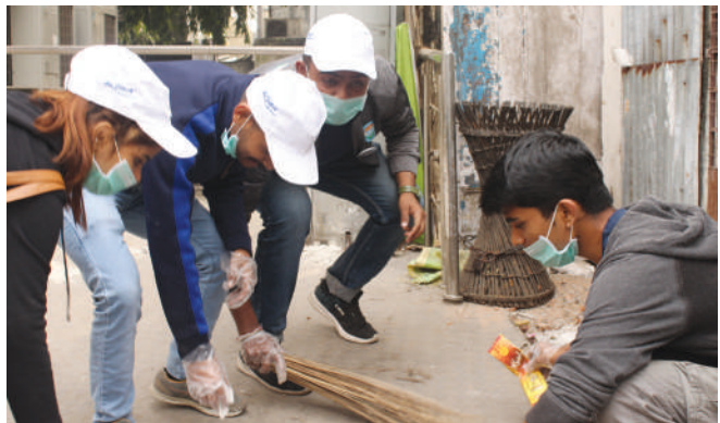
The team cleaning up litter on the road