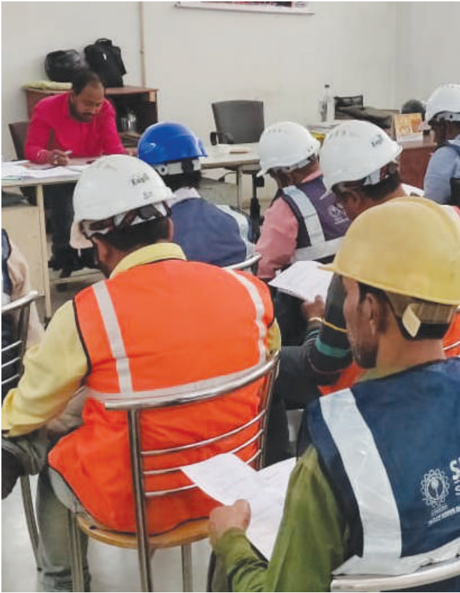
Workers attend the Skill Development programme