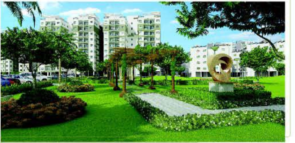
Central Landscape View