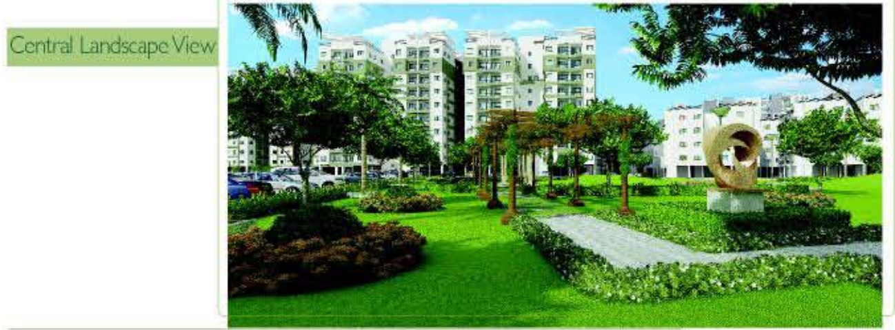
Central Landscape View